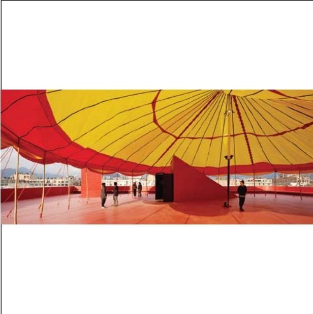
[1] NAVE, Performing Art Hall (Santiago, Chile / 2015)