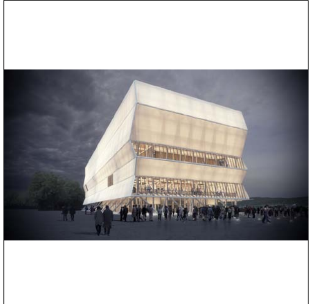
[2] Bio Bio Regional Theatre (Concepcion, Chile / 2011-) © Andres Batlle