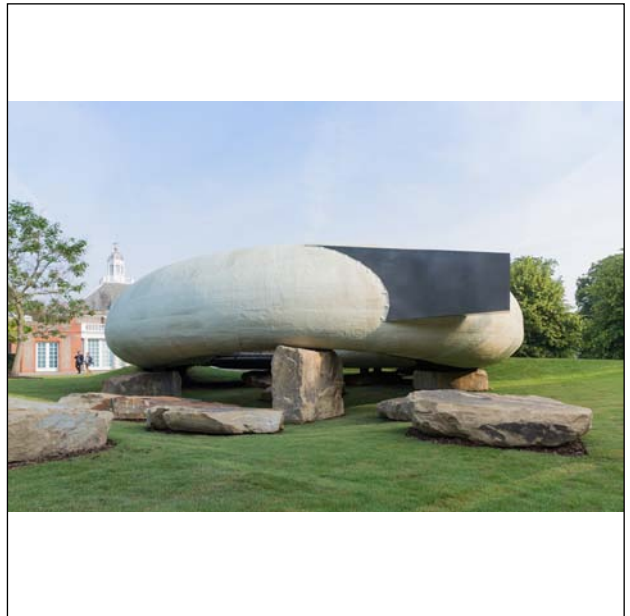
[4] Serpentine Gallery Pavilion 2014 (London, UK/ 2014)

* A separate usage fee is required for this image.