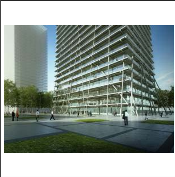
5. Conceptual image of Highrise in Zhengzhou 2 (China, 2012–2013)