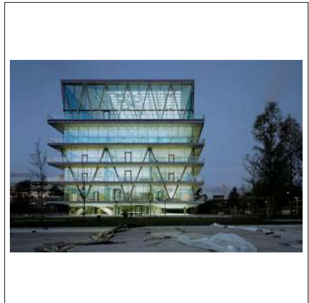
4. School Building in Leutschenbach (Zurich, Switzerland, 2002–2009) ©Walter Mair

For requests for exhibition image data, please contact: