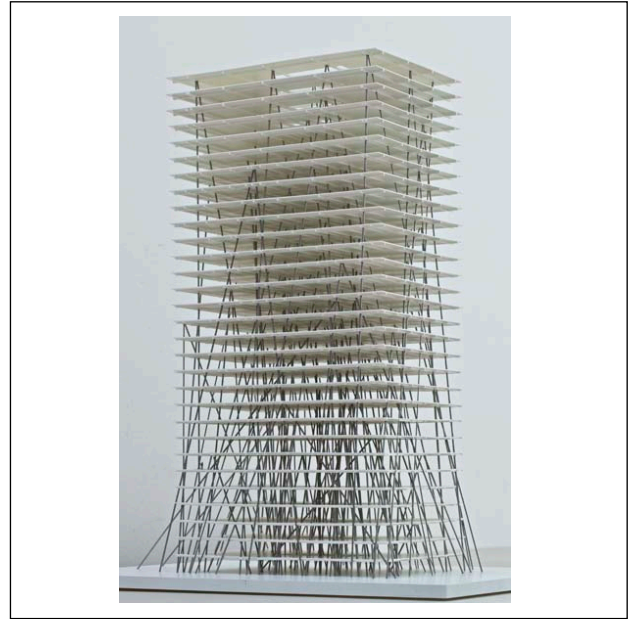
6. Conceptual model of Highrise in Zhengzhou 2 (China, 2012–2013)

For requests for exhibition image data, please contact: