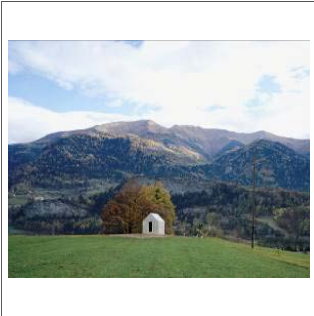
1. Oberrealta Chapel (Grisons, Switzerland, 1992) ©Christian Kerez