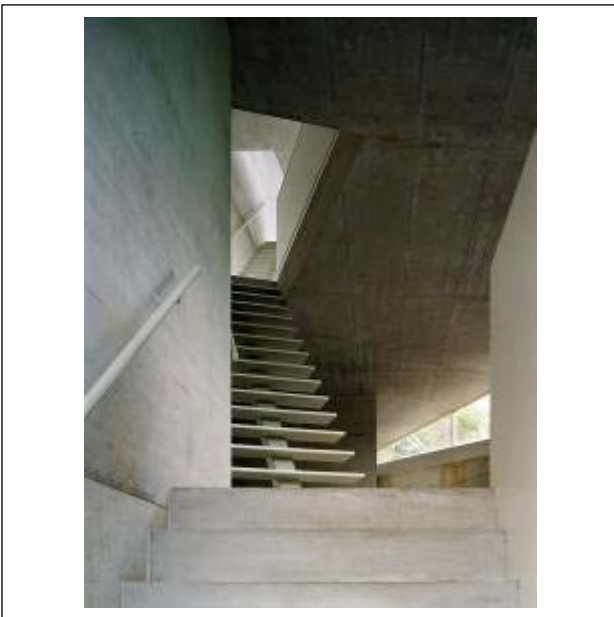
3. House with One Wall (Zurich, Switzerland, 2004–2007)