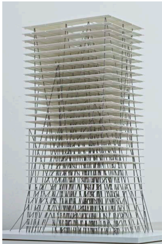
Conceptual model of Highrise in Zhengzhou 2 (China, 2012–2013)

For further inquiries regarding the exhibition, please contact the gallery by email: