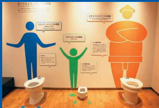
You can even sit on some exhibits and experience the feel.