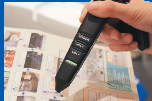
Free audio description service with 'Audio Pen' in English, Japanese, Chinese and Korean.

* As number of Audio Pen is limited, lending may not be possible.