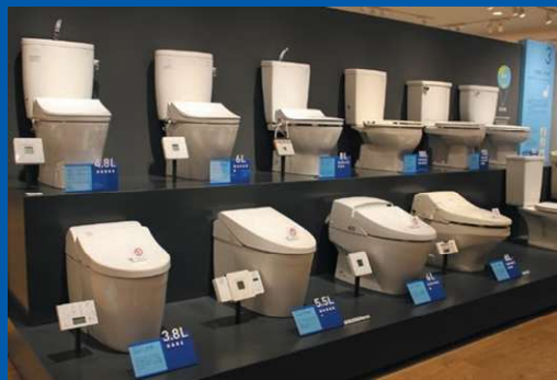
Organized display of the development history of TOTO products, such as ceramic sanitary ware and faucets.