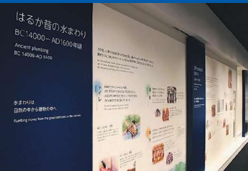
Showcasing the history of plumbing from ancient era until today.

TOTO was established in 'Kokura', Kitakyushu in 1917. At a time when most of Japan was still without sewers, TOTO started with the will of bringing healthy, cultured lifestyles to the Japanese people. Enjoy tracing the development of Japanese lifestyle, featuring abundant plumbing-related materials including toilets.