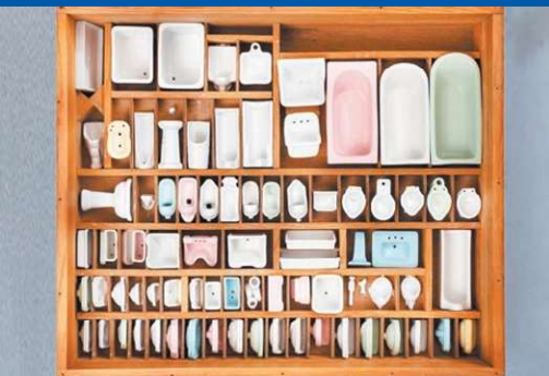
You can see unique exhibits such as miniature samples used when there were no showrooms.