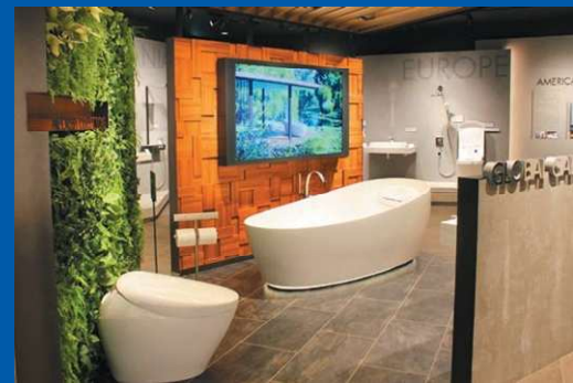
Products marketed all over the world including Asia, the Americas, and Europe, are on display.